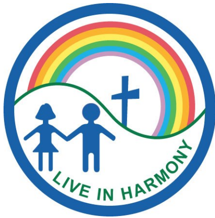
St Michael's Kaleen